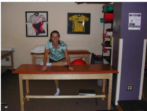
Pigeon on table: Bend knee and cross leg in front of you. Bring torso towards you foot keeping back flat. Hold for: 30-45sec