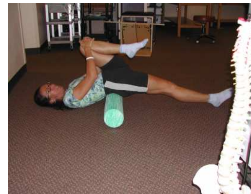
Hip Flexor stretch: Lay on back with foam roller under hip. Straighten leg to be stretched while bending other leg into chest. Lengthen leg out at hip. Hold for: 30-45 sec.