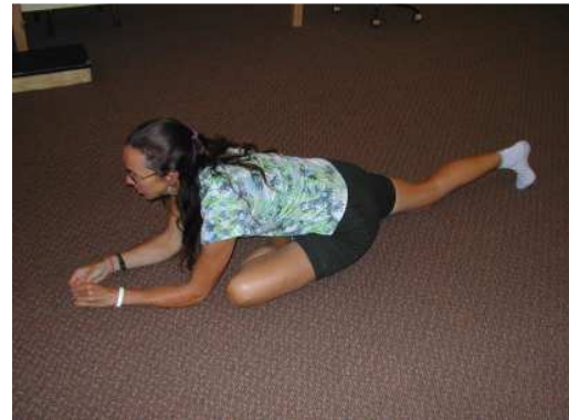
Pigeon stretch: On floor, bend knee and rotate foot towards you. Bring torso towards ground. Hold for: 30-45 sec