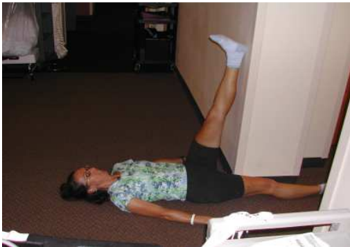
Hamstring wall stretch: Lay on back with one leg up on a wall and the other leg through the door. The closer your hip is towards wall, the greater the stretch. Hold for: 30-45 sec.