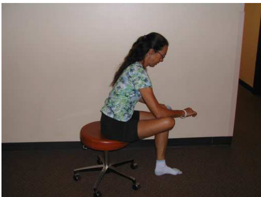
Piriformis stretch while seated: Cross foot over knee and push down on knee of leg to be stretched while leaning torso forward keeping back flat. Hold for: 30-45sec